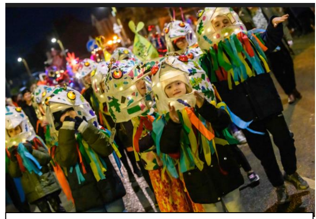
Children enjoying Crook Winter Light Parade