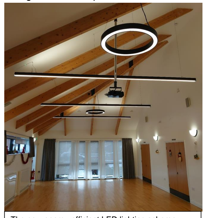
The new energy efficient LED lighting scheme

and also improve the lighting within the building to make a much greater economic, carbon and sustainability difference. A solar panel was installed to supply sufficient power to meet the greater part of current use which would result in a saving of around 50% on electricity costs. In terms of lighting, the main hall is the most used space and currently lit by 10 floodlights. A linear LED lighting scheme has been designed to reduce running costs, offer more control (e.g., lighting only half the hall for smaller groups) and