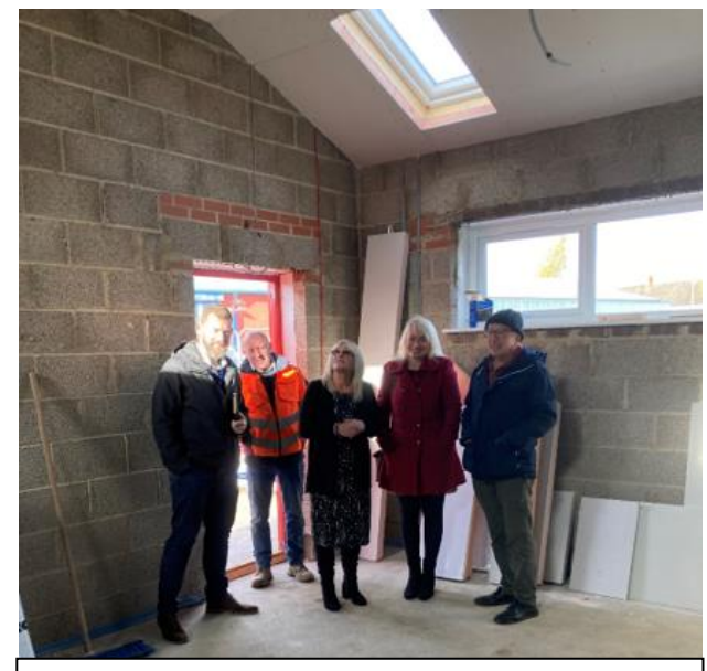
Checking in on the new extension at Woodhouse Close Church and Community Centre

out room for 1-1 meetings will be created, the vestry will be increased in size for much needed office space as well as additional meeting area space.