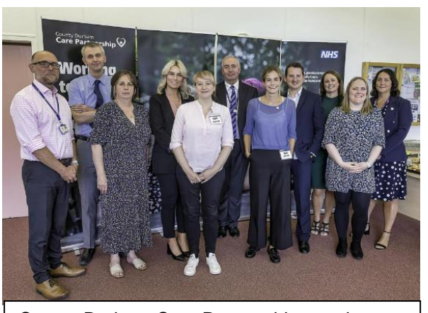
County Durham Care Partnership members

struck by County Durham Care Partnership's culture of continuous improvement, and the teams' commitment to improve the system even further.