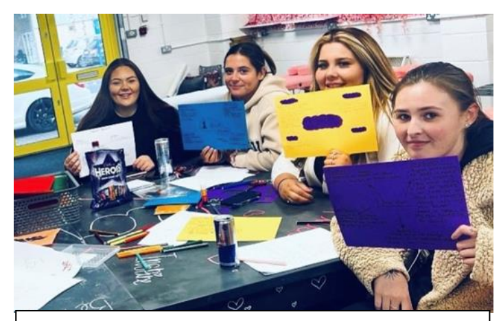
Learning business planning skills

baby recently or are pregnant and the training gives them very practical, accredited training that will help them either become self-employed or work in a salon. The young women involved also look at business planning skills and after the course has finished there is ongoing support from the delivery team.